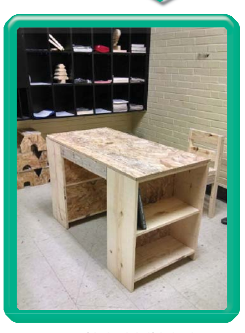
A prototype of the bookshelf/desk to be made by Roosevelt High School students and donated to students in need.

"I honestly enjoyed every single one of my visits... they really put things in perspective. I love this program..." - Teacher